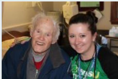
Everyone is Irish on St. Patrick's Day!

Residents and families are invited to purchase a ticket for a special night of food, music, fun, and fundraising. On April 26th, the center will transform into a springtime evening in Paris. Watch for more information coming soon and get ready to kick start the Villa Crest Nursing and Retirement Center 2017 campaign to fight Alzheimer's Disease.