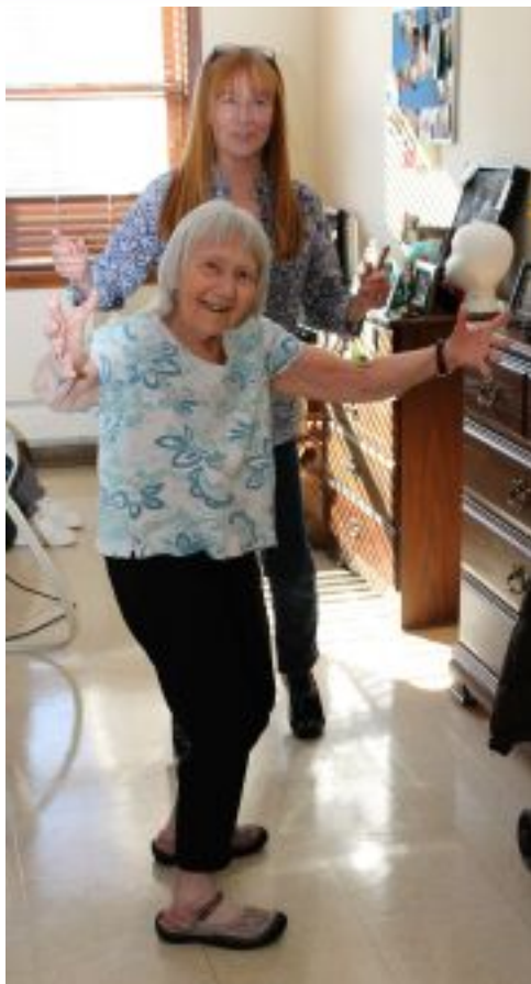
Spring is in the air and everyone feels like dancing and singing!