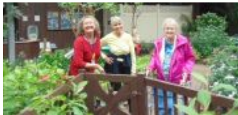
Everyone Enjoyed an Afternoon at 'the Butterfly Place'